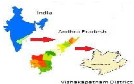
Fig 1.1 Study Area

Visakhapatnam district is a part of North Coastal Andhra Pradesh in India. The district is bounded on the north partly by the Orissa State and partly by Vizianagaram district, on the south by East Godavari district, on the west by Orissa state and on the east by Bay of Bengal. The total geographical area of the district is 11,340 sq.km. The chief water sources of the district are Sarada, Varaha and Thandava rivers and Rivulets Mehadrigeedda, Gambhiramedda and Madhurawada drainage basin in the plain sabari basin a tributary to Godavari River in the agency belt. The net area sown in the district is 3,52,500 ha.